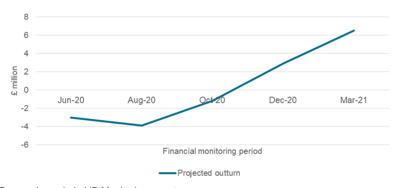
Exhibit 3 Reporting of the projected year-end outturn 2020/21